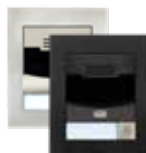
Compact with hidden HD camera

01301-001 nickel (surface mount) 01300-001 nickel (flush mount) 01302-001 black (surface mount) 01303-001 black (flush mount)