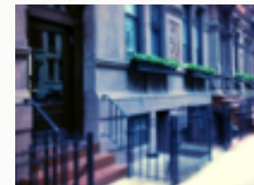
Park Slope, Brooklyn

Our team of professionals will bring years of project management experience to your project and will work one on one with your property to supervise your project from the bidding phase all the way to completion.