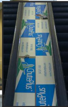
← runner on escalator