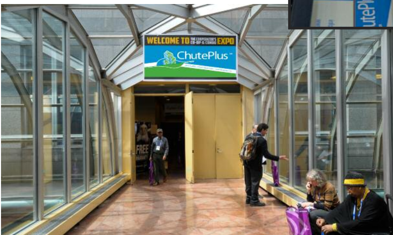
Breezeway Sign Leading to Americas Hall II Entrance Dimensions: 3' x 6'